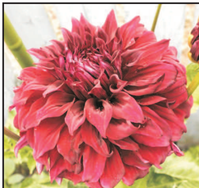
Spartacus -2015 Show Flower