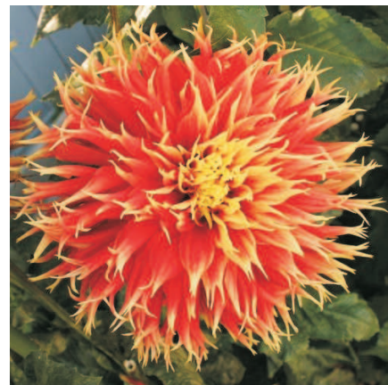
Show n Tell